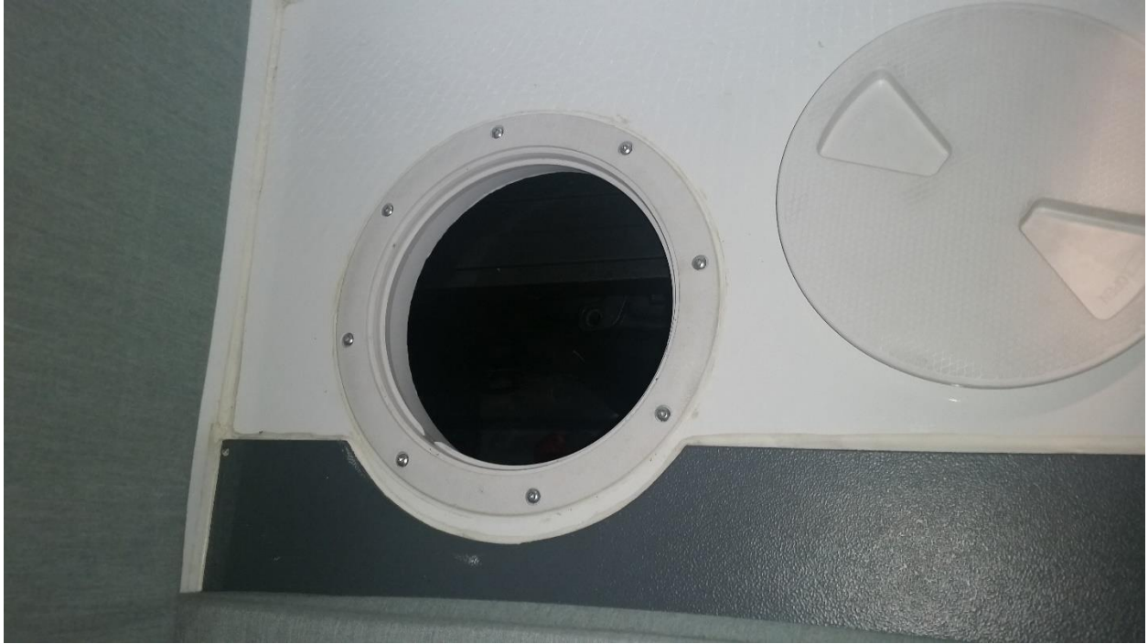
Passenger side front tie down access port

The tie downs are designed to allow some spring extension and compression, keeping the camper secure. With the camper on, in the mounting bracket and on the rubber floor mat, the load on the tie down is somewhat easier. An approximate amount of tension to start is shown in the next pic, you may have to adjust after driving a bit if the camper does not go in square or all the way to the front mounting bracket. Enough tension to retain the camper securely is all that is required.