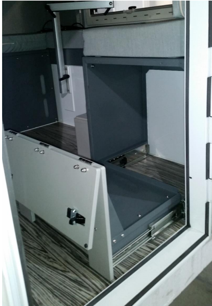
Toilet cabinet in open position