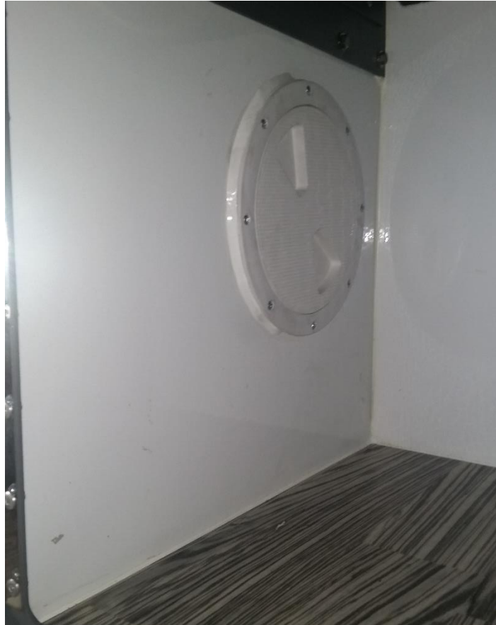
Drivers side front tie down access port

Once camper is resting on the bed, install the Tork Lift Fast Guns. Access for the front tie downs is through the sealed screw in waterproof access ports at the front of the camper. The drivers side access is located inside the lower storage cabinet under the fridge, the passenger side is under the seat cushion at the front.