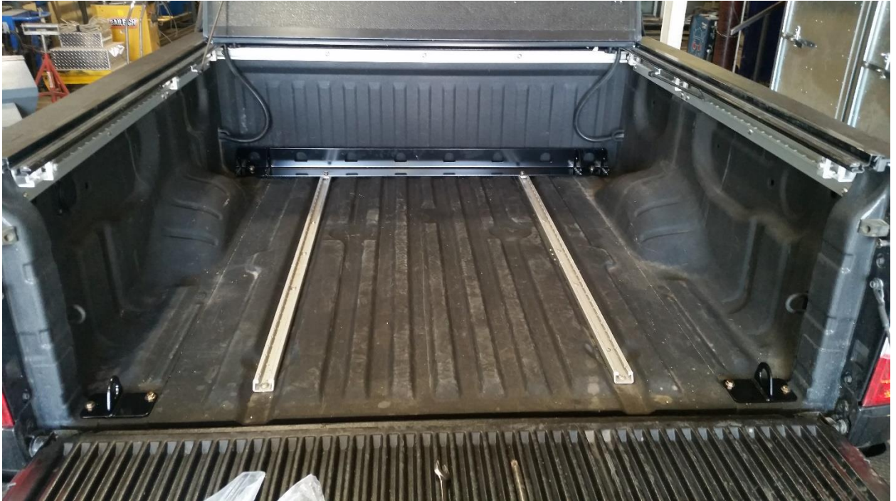
View of installed OEV tie down system

The use of a rubber floor mat under the camper is required, this protects your investment into your truck, and your camper. Overland Explorer is not responsible for any damage to your vehicle or your camper if mounted any other way than specified.