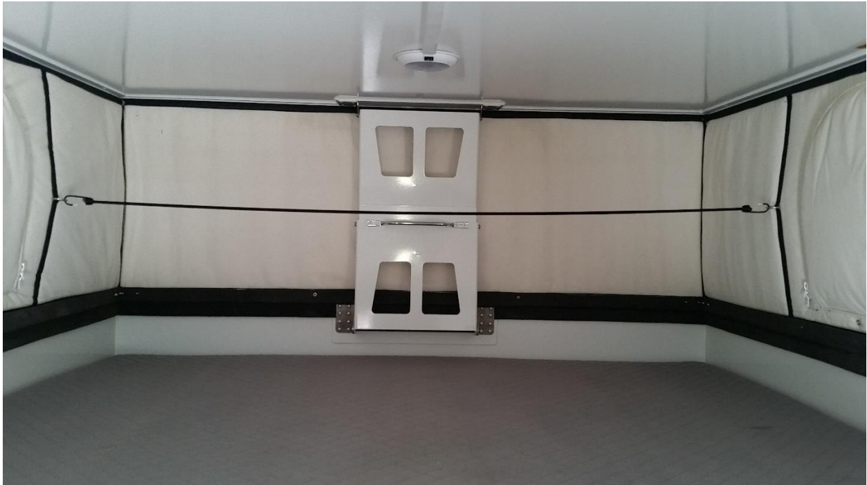
Bungee cords installed; they start the folding process for the soft wall.